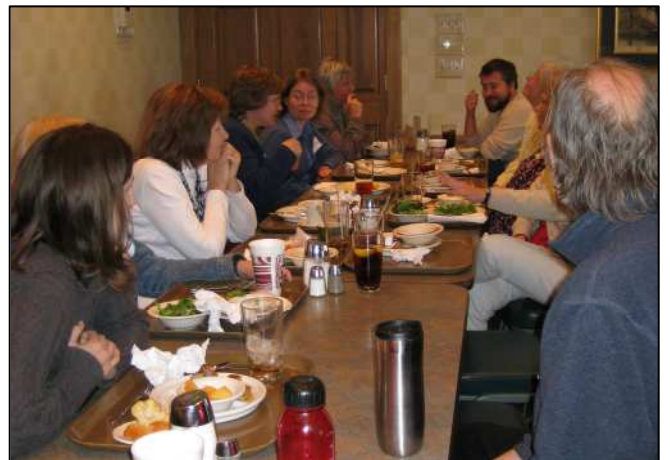
Lunch and conversation

about the "hidden" improvements to SKY v7.0. One member has already placed her order after hearing his presentation! Talking about the software led to comments about how people use their own chosen software. This kind of interaction and conversation is invaluable to new indexers, several of whom were at the meeting.